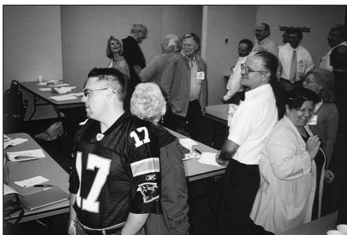
Convention attendees participating in an exercise on cultural differences