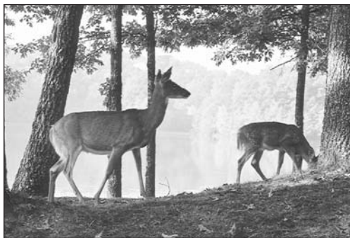
The ubiquitous convention attendees

The next morning may have come too soon for the late-nighters, but we were roused by an early breakfast in the lodge, followed by an 8:30 a.m. meeting. While the breakfast and conversations were enjoyable, much attention was turned to the tame wildlife around the lodge, particularly the deer. We half expected that a fawn would join us for a session.